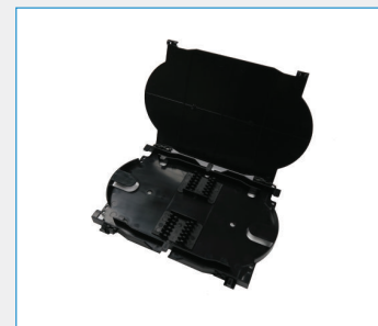
UC9500 24-Fibre Splice Tray (Cover-less)