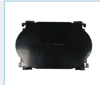
UC9500 Splice Tray Cover